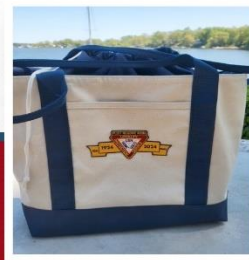
#1004 CENTENNIAL CANVAS BAG The Cotton Canvas Tote is made of 100% cotton canvas. External pocket is for easy storage, spacious interior with a gusset bottom and long contrast straps for a comfortable carry. The tote bag can be personalized for an added fee.