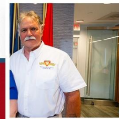
Centennial Button Down White MEN:#1009 WOMEN:#10011 CENTENNIAL BUTTON-DOWN SHIRT (MENS AND WOMENS STYLES) – Two colors – white and blue. 55% cotton/45% polyester.